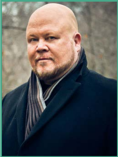
Richard Margison GRADUATED 1979 Critically acclaimed opera singer

The Victoria Conservatory of Music Department of Postsecondary Studies is proud of its 2,500+ alumni around the world.