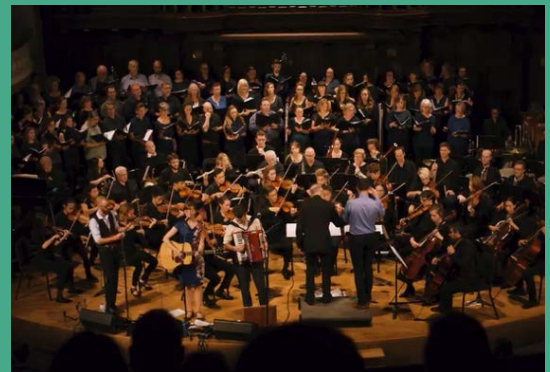
West My Friend