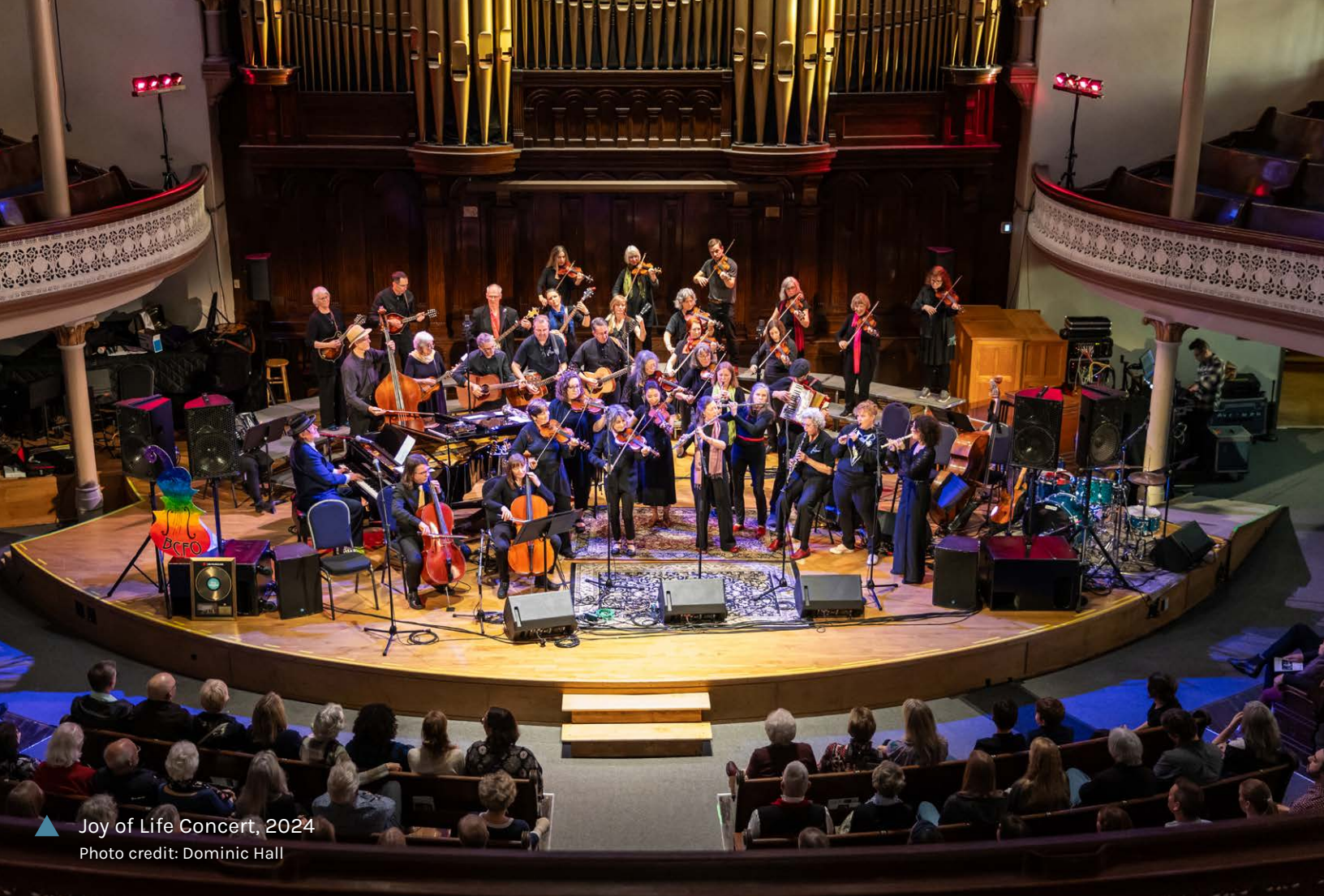
Joy of Life Concert, 2024